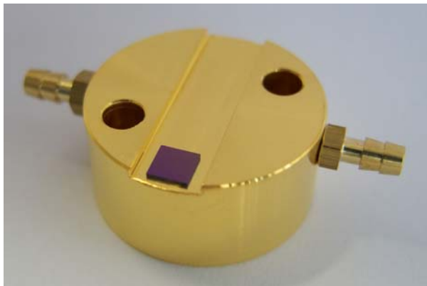
Edge mounted SAM